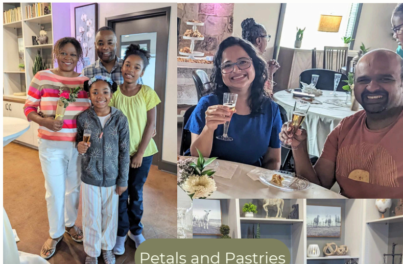
Petals and Pastries