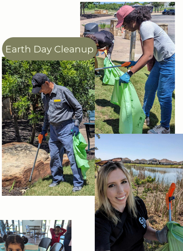
Earth Day Cleanup