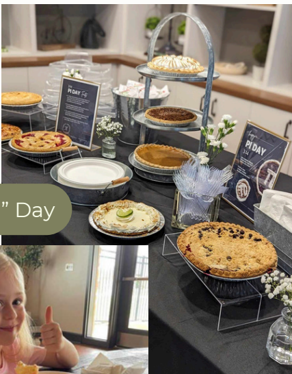
National "Pi" Day