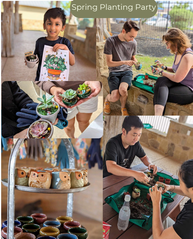
Spring Planting Party

Thank you to everyone who took part in our recent lifestyle events! We're excited to keep fostering our vibrant community throughout the summer!