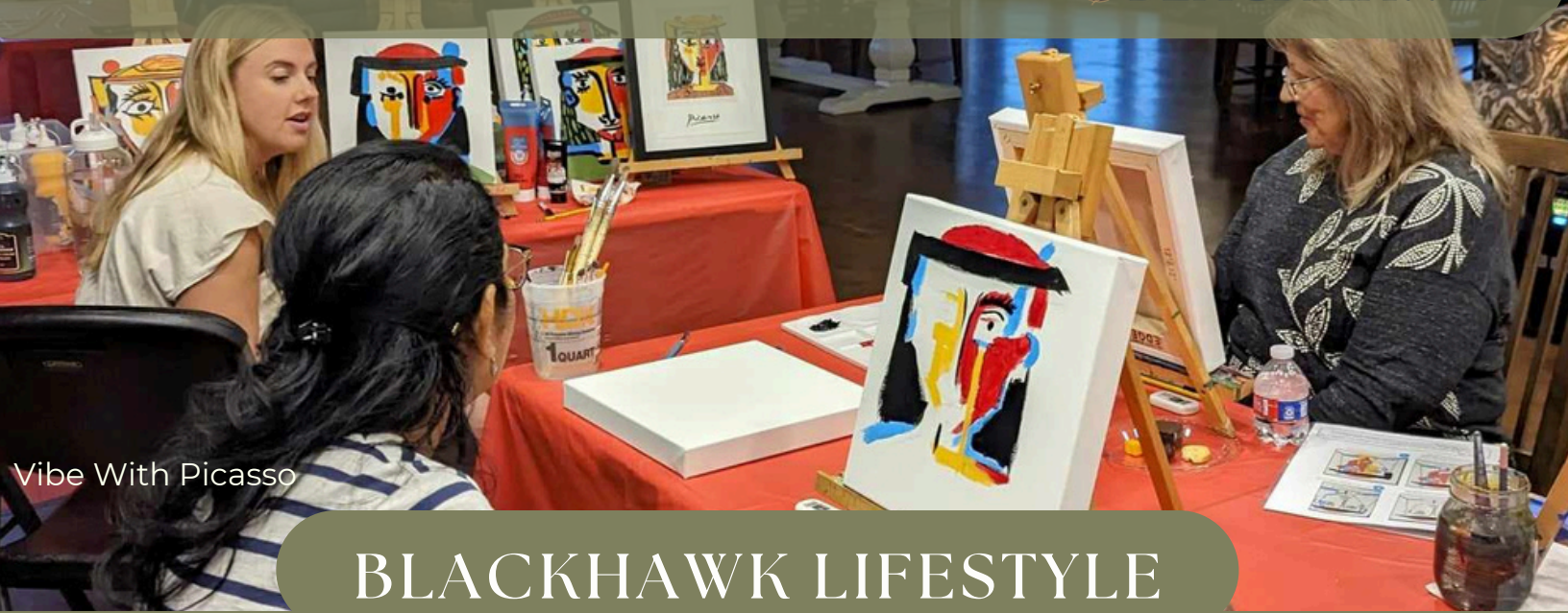
Vibe With Picasso