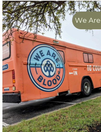
We Are Blood Drive