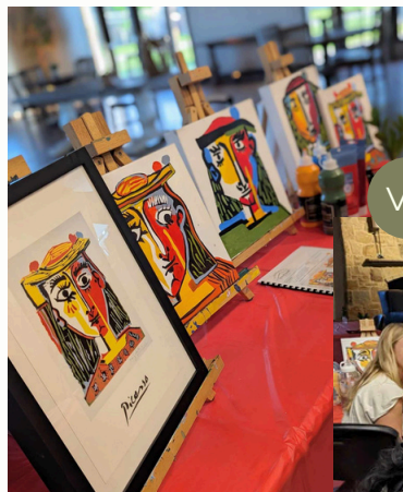
Vibe With Picasso