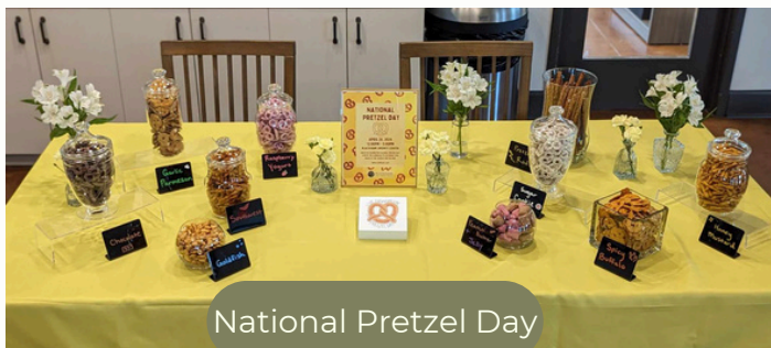
National Pretzel Day