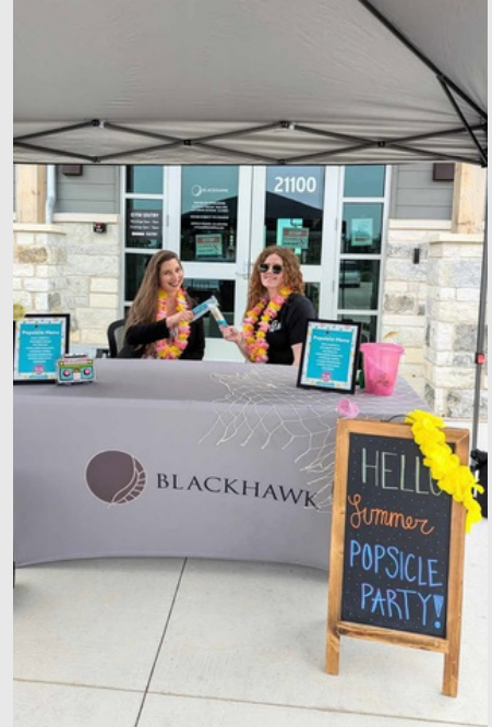
Hello Summer Popsicle Party