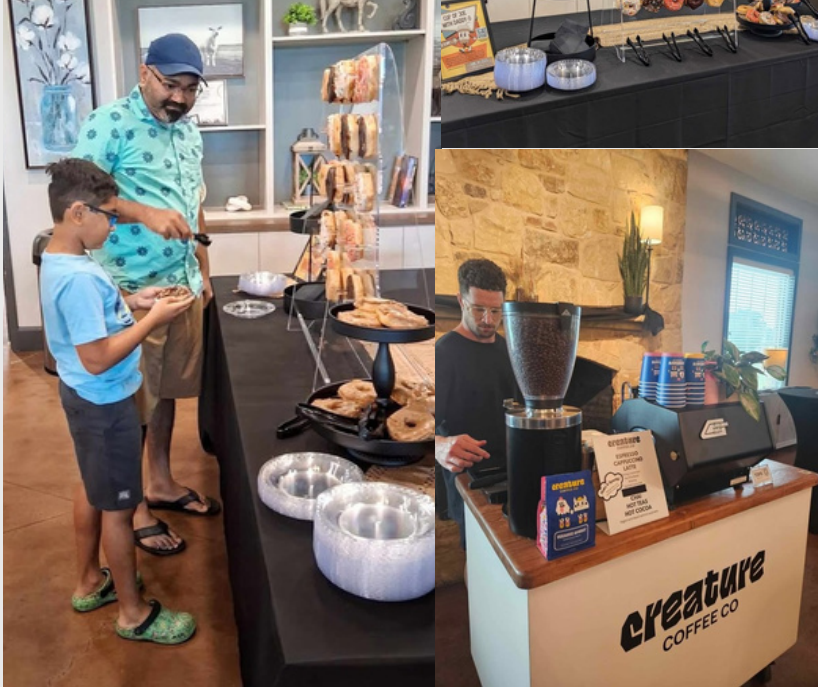
Cup of Joe With Daddy-O